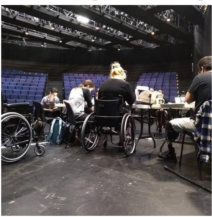
Figure 9. Development workshop of "Emily Driver's Great Race Through Time and Space" by A.A. Brenner and Gregg Mozgala. La Jolla Playhouse.

Figure 9 Image Description (ID): Four people sit around a table, the backs of their heads are down. On the right is a black wheelchair, then the two most visible people: in the middle is a person with light skin and blond hair sitting in a wheelchair, and on the left is a person with brown hair and medium brown skin and a prosthetic leg.