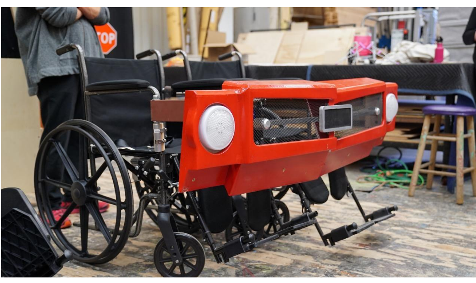
Figure 12. "Emily Driver's Great Race Through Time and Space" by A.A. Brenner and Gregg Mozgala Photo courtesy of La Jolla Playhouse. Scenic: Sean Fanning

Figure 12 Image Description (ID): Two black wheelchairs with footrests, side-by-side, in profile. Across the front of the chairs is a red fender with white headlights and a mesh metal grill in the middle.