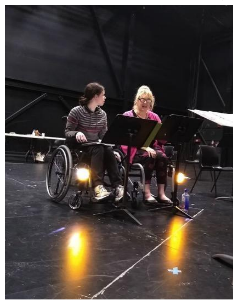
Figure 10. Development workshop of "Emily Driver's Great Race Through Time and Space" by A.A. Brenner and Gregg Mozgala. La Jolla Playhouse.

Figure 10 Image Description: Two actors with light skin sit in wheelchairs side by side on a black stage, back wall, and music stands in front. On the outside of each