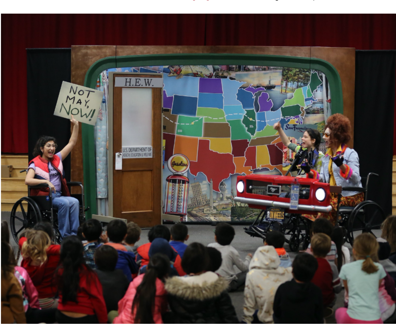
Figure 7. "Emily Driver's Great Race Through Time and Space" by A.A. Brenner and Gregg Mozgala. LJP 2020.

Figure 7 Image Description (ID): Three actors in front of a map of the U.S., and a door with "H.E.W." on top. An actor