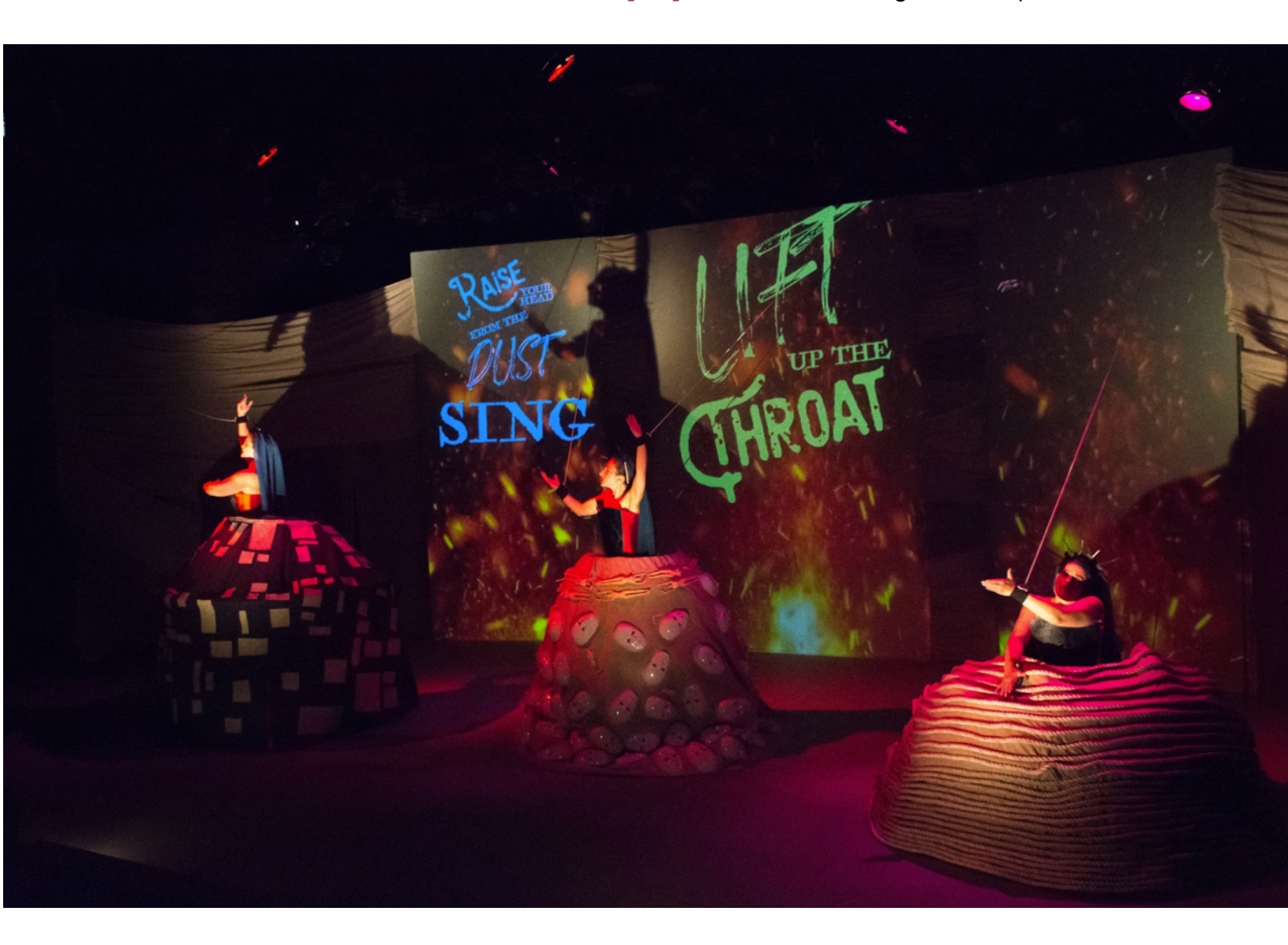
Figure 4. Carolyn Agee, Mary Schaefer, Sydney Maltese in "Peeling" by Kaite O'Reilly, Sound Theatre Company, 2019.

Figure 4 Image Description (ID): Three women with light skin tones are spaced across a dark stage. They are each inside a large ballroom skirt while their arms are connected to wires that control their wrists. The